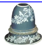
R-535 Blue satin two-color Cameo fairy-size dome, Clarke lamp cup, matching flared base decorated w/butterfly. $6250.