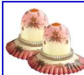
R-533 Pair of decorated acid Burmese fairy-size lamps with crystal lamp cups and decorated Burmese bases. $4100.