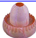
R-600 Red Nailsea fairy-size in clear Clarke lamp cup in matching rounded base with inward crimped rim. $775