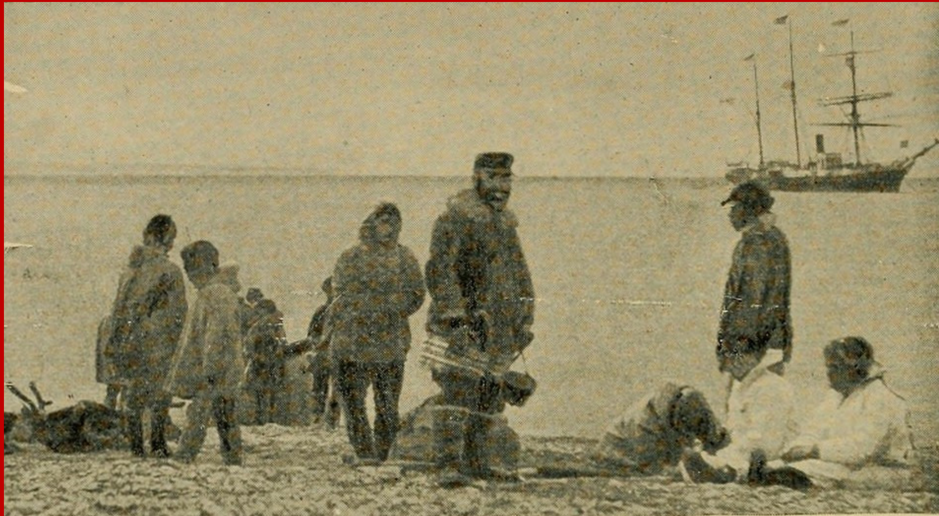
Sheldon Jackson landing 1st herd of reindeer in Alaska, July 4 th , 1892. The USRS Bear is anchored in background