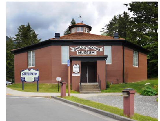
Above: Sheldon Jackson Museum on the grounds of the Sheldon Jackson College in Sitka, Alaska Left: Sheldon Jackson Memorial Chapel built by Jackson in Fairplay in 1874 Now known as South Park Community Church.