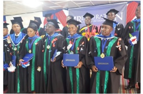
Bible College Graduation in Monrovia, Liberia