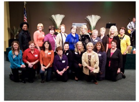
2009 Women's Conference held in Fairmont, WV.