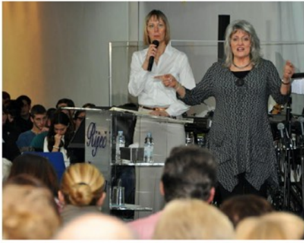
Word of Life Church, Zagreb, Croatia.