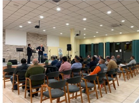
Apostolic Marketplace Center in Altea, Spain.