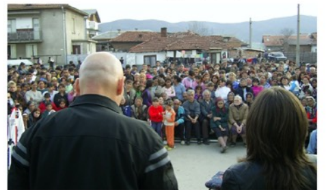
Ministry among the Gypsies of Bulgaria.