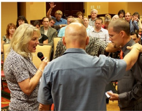
2008 RFI Conference in Hendersonville, NC.