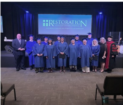
2020 Graduating Class at Restoration College International in Fairmont, WV.

me with a “word from the Lord” telling me that I was supposed to organize a ‘fellowship for churches and ministers’ that he would be part of. I was shocked and had no previous notion to do something along that line so I went off for a season of fasting and prayer. On the fourth day, God spoke to me, “Organize Revival Fellowship as a network for churches and ministers’, what we now call “an Apostolic Network.” I followed up immediately and we had our first meeting as a network in July 1995 in Fairmont, WV with five official members. It was the beginning of a “restoration revival movement” that has gone progressively on for 25 years to include churches and ministers in 13 states and 7 nations.