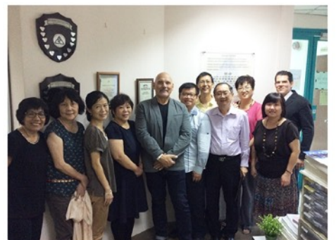
Teaching in Pentacostal Bible College in Singapore.