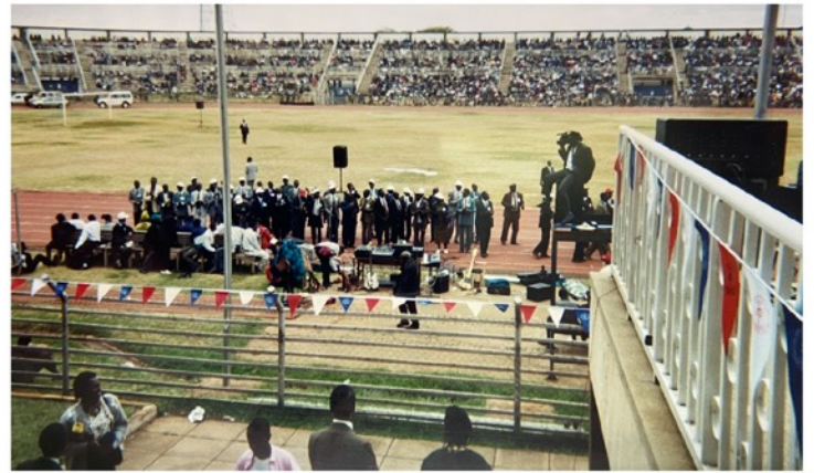
50th Anniversary of Full Gospel Churches of Kenya.