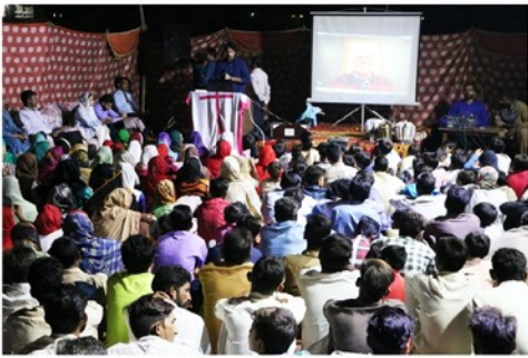
Skype Crusade Lahore, Pakistan.