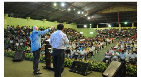
Santa Cruz , Bolivia.