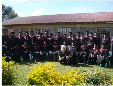
Eldoret Bible College Graduation, Kenya.