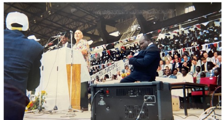
Keynote speaker at 50th Anniversary of Full Gospel Churches of Kenya.