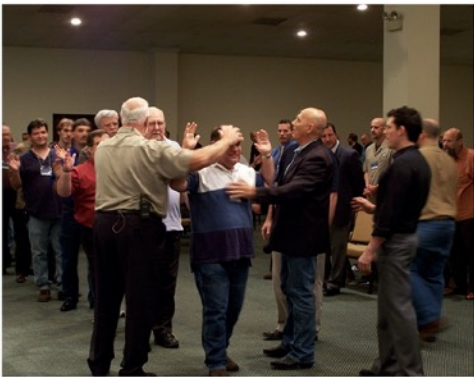
Men's Conference held in Fairmont, WV.