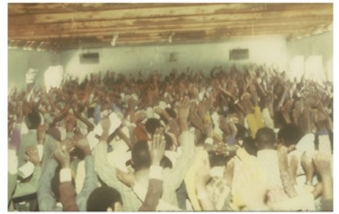
Hundreds of youth receive the Word of God in Kenya, 1983.

In 1994 I was led to leave the denomination which was a very difficult decision to make after 14 years of serving in various positions and ministries. I was also among the top tithing pastors and contributors to the World Mission department, we were well established and known by the organization. We had three noted prophets visit us at different times during the six month period of prayer before making the move, all three not having spoke to one another prophesied our exit and beginning of a new day in our lives. At this time, a well respected Evangelist contacted