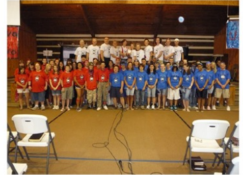
RFI Summer Teen Camp.