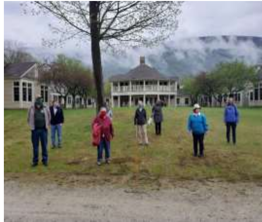
Some of us waiting with our balloons and flowers.