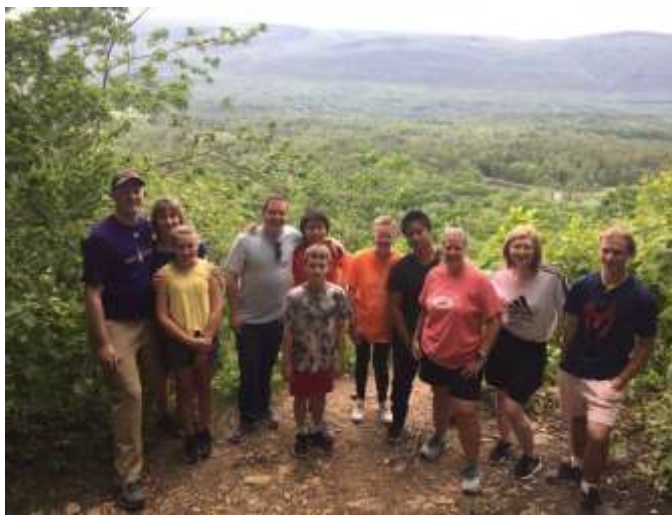
The youth activity hike with the missions group from Lansdale.