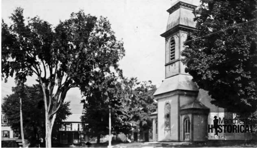
Bottom photo is from 1925