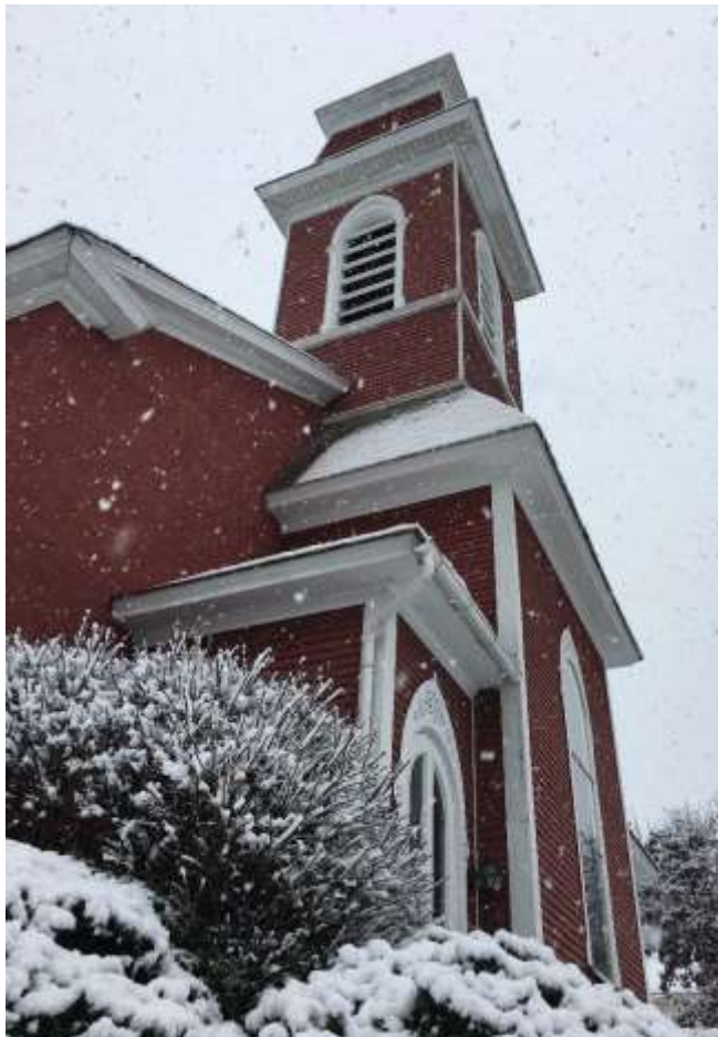
during one of the recent snowstorms.