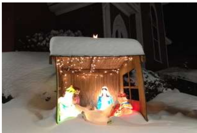
Our outdoor creche with the church in the background.