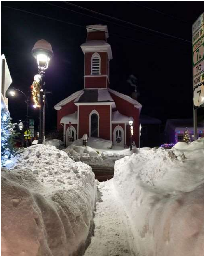
"MEMORIES" (Winter of 2020)