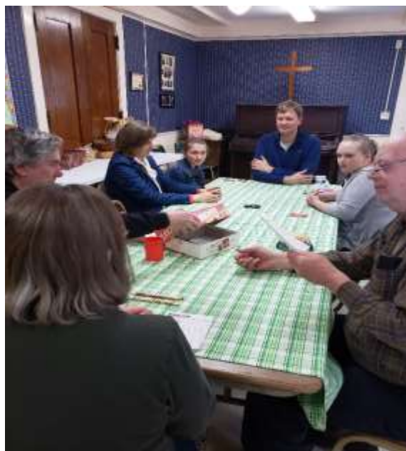
Photos from the Cabin Fever Pot Luck & Game Night