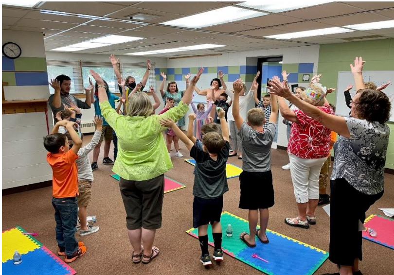
Sunday School Blast Off Day in the Glow Room