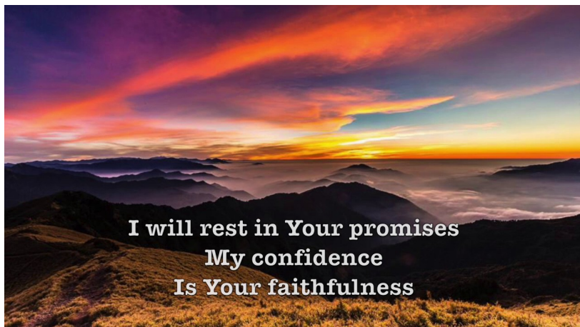
The Promise - The Martins