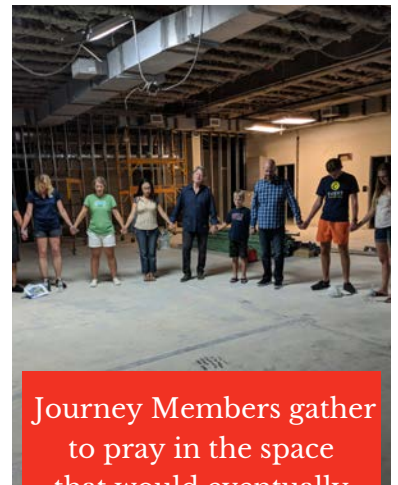
Journey Members gather to pray in the space that would eventually become our Worship Center.

We had just moved into the Ministry & Worship Center a few months before after meeting in rented facilities for 8 years. It was an exciting time for our church as together we had sacrificially given to raise the funds to make the downpayment and renovate the former "Chickie's Night Club" into a home for our church. The dream had become reality. But we still had a long way to go!