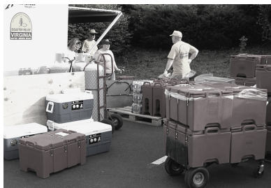
BGAV Disaster Response Team.

In 2017 a team from FBCA received training in disaster response coordination. When a disaster strikes, we can quickly dispatch 3 to 5 people to man a trailer, set up a command center, assess needs, and inform the BGAV, a network of churches for missions & ministry, of what is needed as a part of the Incident Command response.