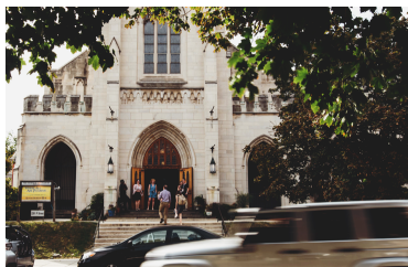
Grace Capital City Church