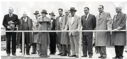
1952 Ground Breaking

1949 The King Street property is purchased.