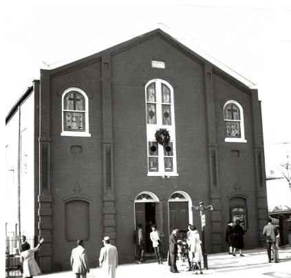
Alfred Street Baptist Church