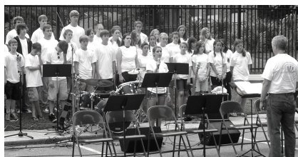
2010 Youth Choir mission trip to South Carolina.

In 1996, the youth choir begins to take annual mission trips across the United States. They share their faith, conduct neighborhood Vacation Bible Schools, and help with minor construction projects.