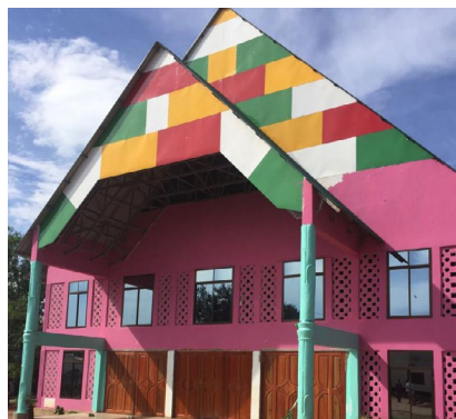
The New Cathedral