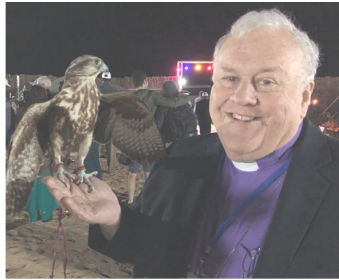
Dinner in the Desert with hunting falcon

The basic model is a Discovery Bible Study (or “Spiritual Conversation”). A short Bible passage is shared, and students look for what Jesus is asking them to obey for that week . After everyone has practiced retelling the story, discussion ensues as follows: