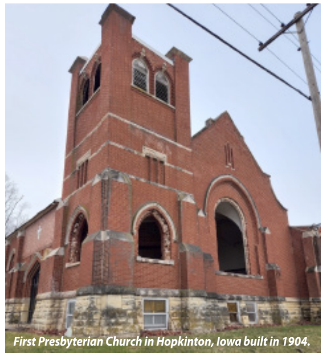
First Presbyterian Church in Hopkinton, Iowa built in 1904.

Every week I am embraced with outpouring love from His children. I am beyond blessed and grateful. The verse that comes to this farm girl’s mind is Ecclesiastes 3:1 “There is a time for everything and a season for every activity under the heavens.” While change occurs in our lives, our God is constant and will not leave us. Where we worship God doesn’t matter, it’s the act of worship that does. It’s being the church and living out the Gospel in our words and actions. Jesus wasn’t complacent about where He spread the Gospel, and neither shall we. To God be the Glory!