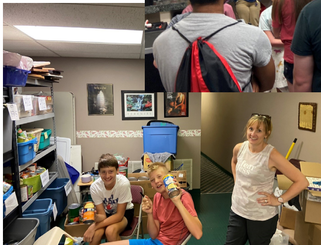
Youth and parents sort items at Ogden Friendship House of Hope during Youth Mission Week 2022.