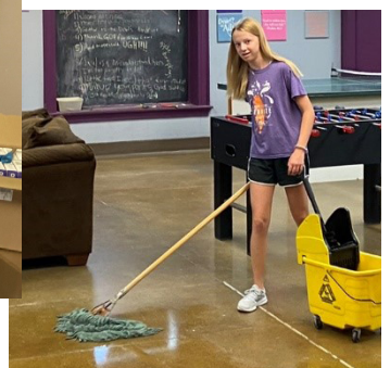
Service to the church during Youth Mission Week 2022.