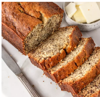
Samples from Treasures and Sweets 2021 in photos to left.

OASIS WILL BE EVERY FOURTH TUESDAY EACH MONTH - AUGUST 23