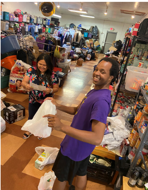
Youth and parents sort items at Ogden Friendship House of Hope during Youth Mission Week 2022.