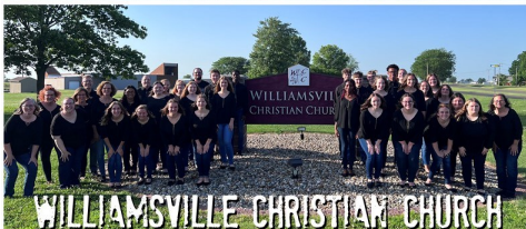
WILLIAMSVILLE CHRISTIAN CHURCH