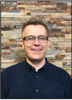
Laurin Hill Worship Ministry