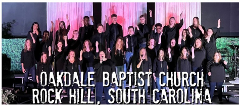
OAKDALE BAPTIST CHURCH ROCK-HILL, SOUTH CAROLINA