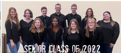
SENIOR CLASS OF 2022