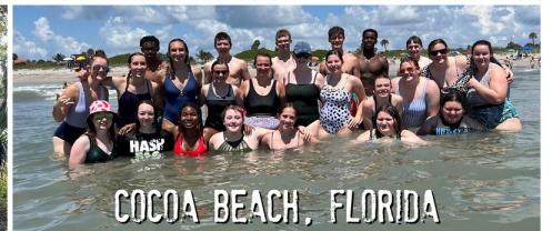
COCOA BEACH, FLORIDA