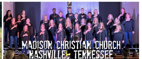
MADISON CHRISTIAN CHURCH NASHVILLE, TENNESSEE