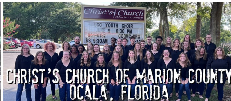
CHRIST'S CHURCH OF MARION COUNTY OCALA, FLORIDA