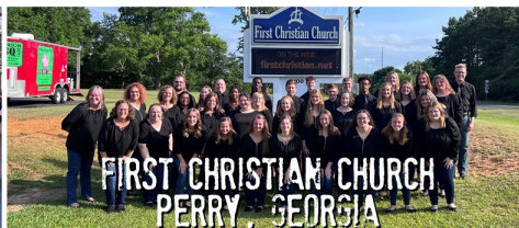
FIRST CHRISTIAN CHURCH PERRY, GEORGIA