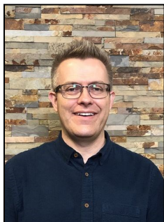
Laurin Hill Worship Ministry