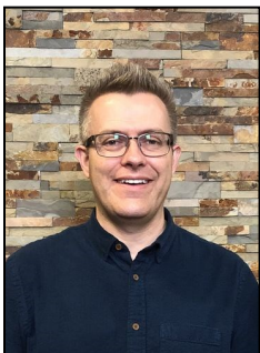
Laurin Hill Worship Ministry