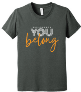
YOUTH SHORT SLEEVE TEE $12