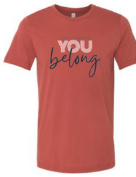
UNISEX JERSEY SHORT SLEEVE $12