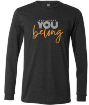
UNISEX JERSEY LONG SLEEVE $16