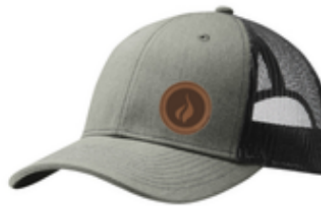
SNAPBACK TRUCKER CAP $12