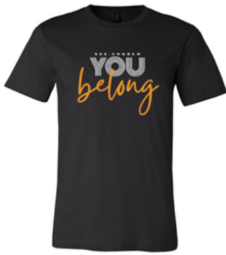
UNISEX JERSEY SHORT SLEEVE $12