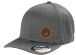
PORT AUTHORITY FLEXFIT CAP $15