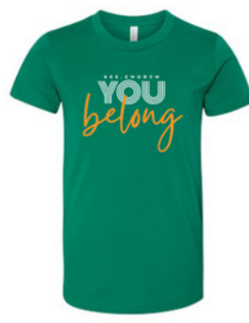
UNISEX JERSEY SHORT SLEEVE $12