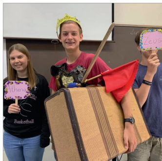
9th Graders reenacting the Odyssey