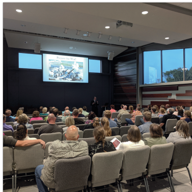
2019 State of the School Address

God is doing exciting things at Libertas! The equivalent of 141 New Monthly Recurring Legacy Partners have joined the mission since the State of the School address in September! We are 259 away from our goal of 400 Legacy Partners at $25/month by June 2020. How can you help us reach this goal?