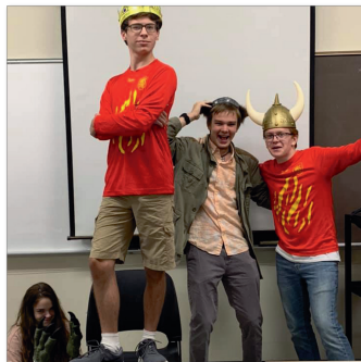
11th Graders reenacting Beowulf