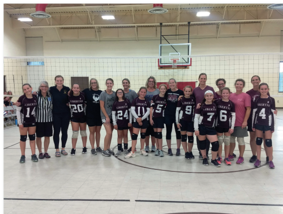
First Annual Middle School Mother/Daughter Volleyball game