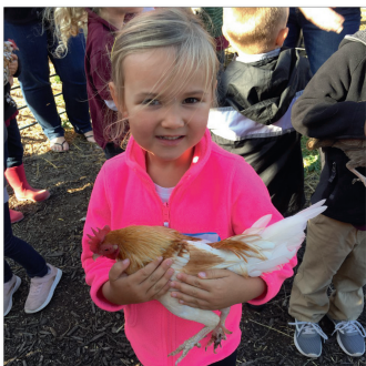
Pre-K field trip to the Critter Barn