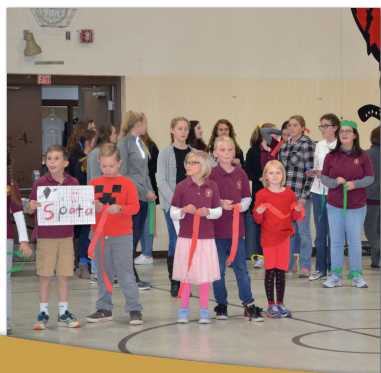
House Charis assisting the 3rd grade class with their "Mini Olympics"

In biblical Greek, Charis means "Beauty of Grace". Charis is often translated "grace", but when we looked at it together as a group, we found it also means "encouragement". As a house, we meet weekly for a time of devotion and discussion. In these meetings we also make plans for parties, service projects, and ways we can encourage our peers. This year we've adopted the third grade class, and were able to participate with them in their "Mini Olympics". Incoming 7th graders and new students are assigned to a house, and remain with that house through graduation, so there's a bit of an age range by design. This structure provides great opportunities for mentorship, in addition to developing close friendship. As we get together weekly, and discuss things going on in life, our hearts tend to grow closer throughout the year. This year, our house verse is 2 Peter 3:18, "Grow in the grace and knowledge of our Lord and Savior Jesus Christ." The greatest part about being house captain this year has been the growth I've gotten out of it, personally. Throughout the processes of writing devotions, encouragements early Monday mornings, and being a positive presence consistently, I've learned a lot, and grown closer to God. In addition, I had a blast volunteering in the mini-olympics. We helped run each event, then joined the contestants in a feast. It was a great chance to laugh with each other, and to get to know the third graders.