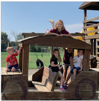
Students playing during recess

In conclusion, we know that Libertas has not "arrived" – we are still growing and developing in all of the above areas under the Lord's faithful leading, and we truly appreciate that being "Intentionally Classical, Vibrantly Christian" must go hand-in-hand! It is an exciting journey!