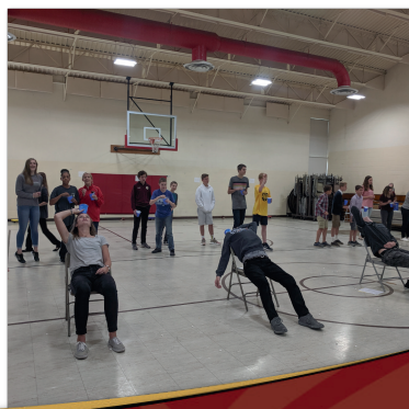
House games occur once per month during lunch hour.