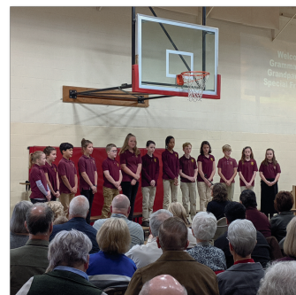
Grand Parent and Special Friend's Day 2019

LIBERTAS CHRISTIAN SCHOOL INVITES YOUR PASTORAL STAFF AS OUR HONORED AND CELEBRATED GUESTS