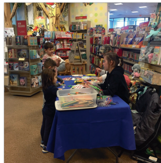
Barnes and Noble Book Fair