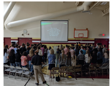
First day of school Chapel

Look for Christ and you will find Him, and with Him everything else. - C.S. Lewis