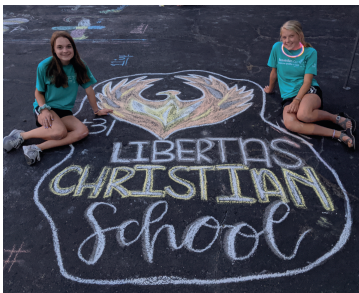
Students serving at Beaverdam CRC Community Days

Hobbies Running, triathlon, hiking. I am on My Team Triumph which enables those with special needs and abilities to compete in races.