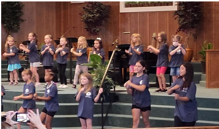
Dancers performing Put on the Armor of God

Thank you to all the wonderful coaches, volunteers, and registration workers that made this week possible; and to those who donated to cover the cost of t-shirts for the students, allowing us to provide this camp as a free ministry to our community.