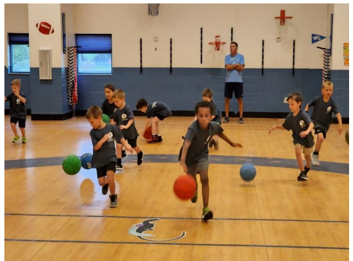
Students working on their dribbling and handling