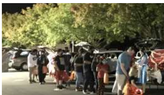
Scenes from our socially-distanced fun, family Trunk-or-Treat

presented them with their Bible. Dads, moms, grandparents, brothers and sisters, even some family dogs gathered on the doorstep to receive this treasured gift. Please pray for our Kids Ministry staff as they continue to find creative ways to bring Jesus to the children of our church. Check out our next event, Night in Bethlehem, on page 4!