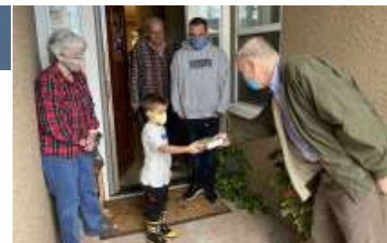
Centerpoint first graders received their Bibles from our pastors at home

presented them with their Bible. Dads, moms, grandparents, brothers and sisters, even some family dogs gathered on the doorstep to receive this treasured gift. Please pray for our Kids Ministry staff as they continue to find creative ways to bring Jesus to the children of our church. Check out our next event, Night in Bethlehem, on page 4!