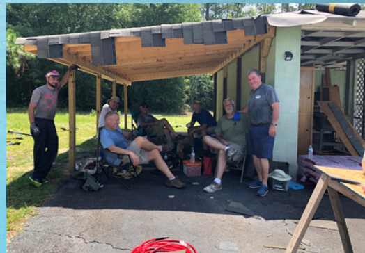
The Salkehatchi men taking a breather while working a 12 hour day on Saturday.