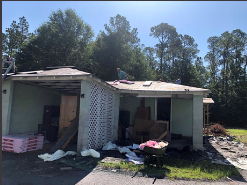
Before Roof Repair.