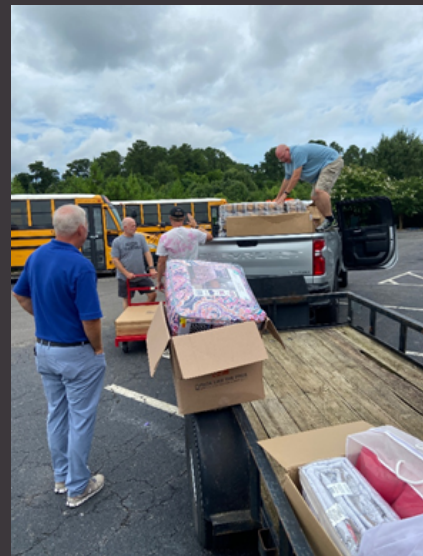
Thanks to the volunteers who picked up the beds and brought them to The Bridge.