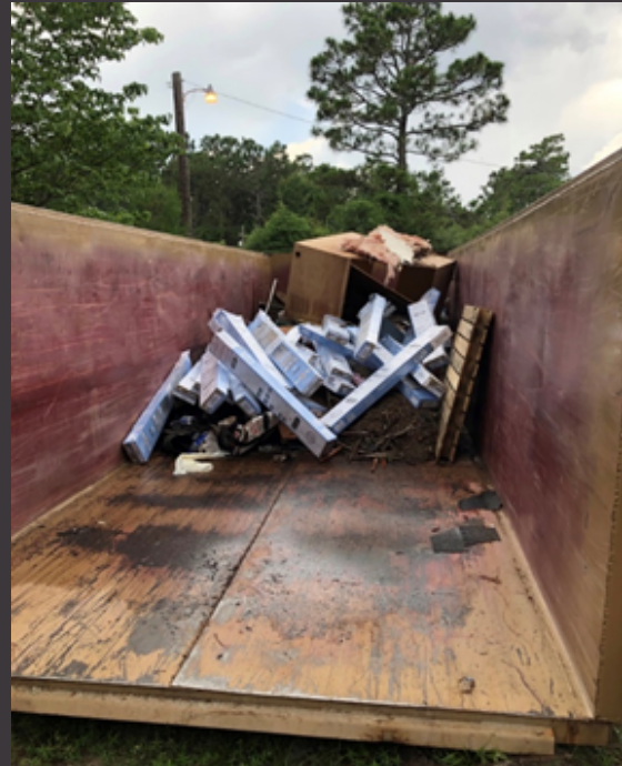
Thanks to Dumpster Depot for providing the Dumpster throughout the month.