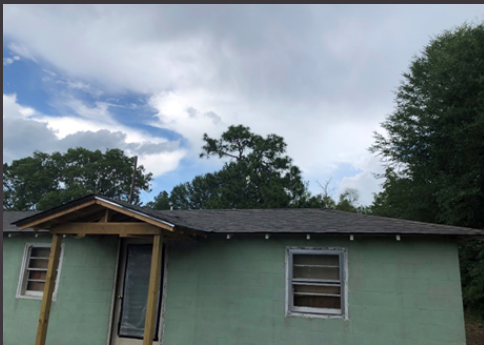
After Roof Repair.