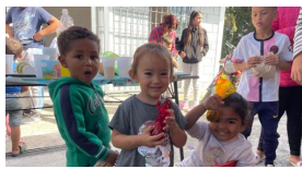
Some kids with their treats on Easter