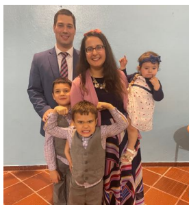
We tried to take an Easter family photo!