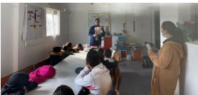
Teaching a kids' class