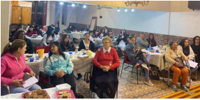
A Ladies' Meeting