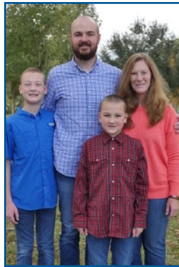
2019 Family Photo