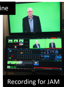
Recording for JAM

In January of 2020, I happened upon a friend's Facebook post talking about how people can share the gospel on social media (specifically an app called TikTok ). I made my first 1-minute Gospel video on TikTok on January 3rd. Since posting that video, I have also been posting similar videos on Instagram (another social network). Instagram created a feature called "Reels," which is just like Tiktok, but is more widely used. I almost can't believe the incredible fruit that the Lord has brought through this avenue!