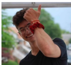
Jewish man who got saved

As of the writing of this letter, God has allowed my videos to have almost 4 Million views with over 20,000 comments responding to salvation invitations, and well over 300 confirmed decisions to trust Jesus as their