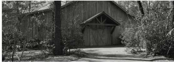
WAVERUNNERS MIKE'S FARM DECEMBER 7TH

The “Batons” have been circulating now for a week and, in some cases, are close to completing their route! Attached to these “batons” will be packets containing pledge cards for the 2022 Mission and Ministry and the Capital/Debt Reduction Budgets of First United Methodist Church. The pledge card invites you to express your generosity in estimating your giving for 2022. After you prayerfully complete your pledge, you pass the “baton” to the next household. If you haven’t seen your “Baton” yet, feel free to call the church office to determine your “coach” (the person tracking the route). Don’t let the “baton” drop! If we work together, we can finish the “race” and equip the ministries to which God is calling us in the new year. Ready, Set, go!