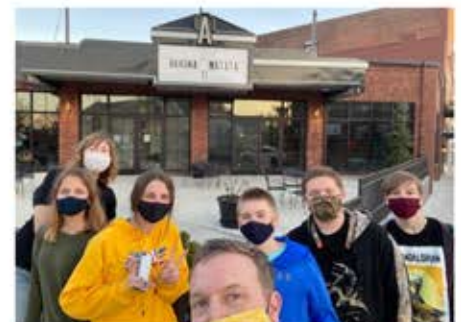
Chi-Rho on their March 7 gathering. They loved the Hakuna Matata sign across from the church.

Mar. 28: Help with Egg Hunt Hiding (TBA)