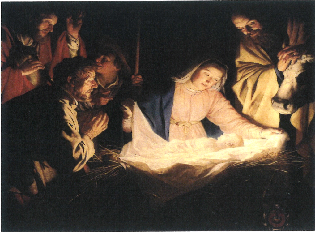
Painted by Gerard Van Honthorst, 1622

Christmas Eve Service December 24, AD 2021