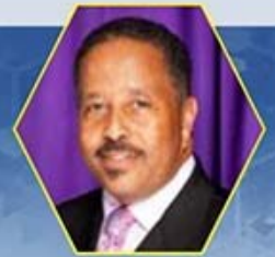
Bishop MICHAEL HANNAH SUN | 10:15 AM

HOST HOTEL: Omaha Marriott Downtown | 222 N 10th St, Omaha, NE 68102 | 402.807.8000 Rate: $159 + tax (Std room) / $259 + tax (Suite) | Reservation Deadline: March 3, 2019