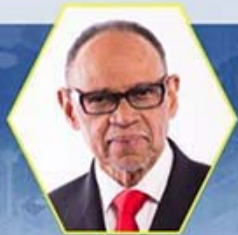
Bishop THEODORE BROOKS THR | 7 PM