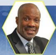
Bishop NOEL JONES WED | 7 PM