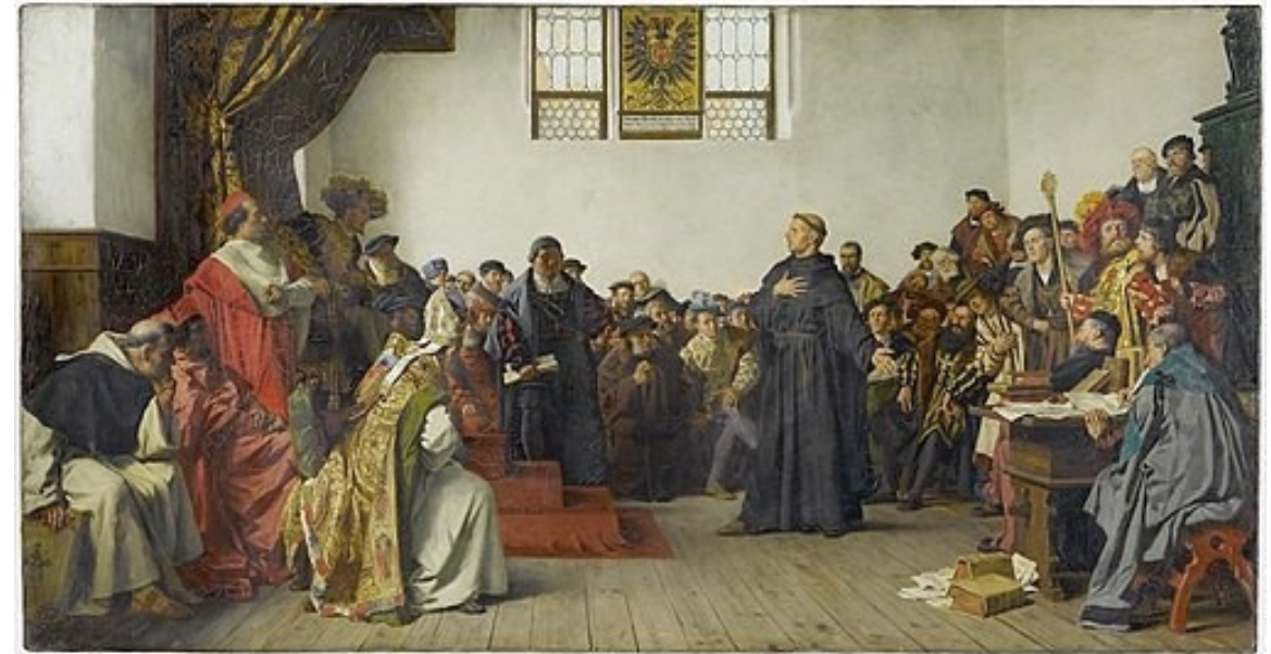
Luther Before the Diet of Worms by Anton von Werner (1843-1915)