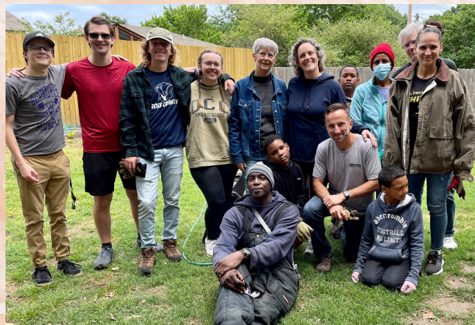
DAY OF SERVING - 2022