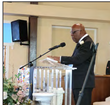
Church Connection | Lawton, Friendship