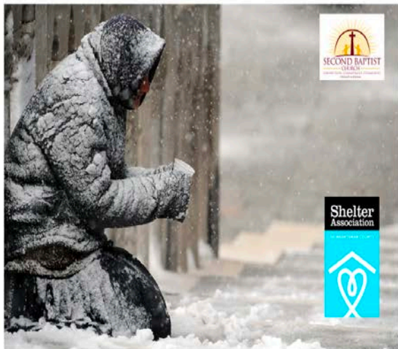
SHELTER ASSOCIATION OF WASHTENAW COUNTY ENDING HOMELESSNESS ONE PERSON AT A TIME

Due to the ongoing COVID-19 pandemic, unfortunately, Second will not be able to house men from the Shelter Association of Washtenaw County (SAWC) rotating shelter program as we have in years past.