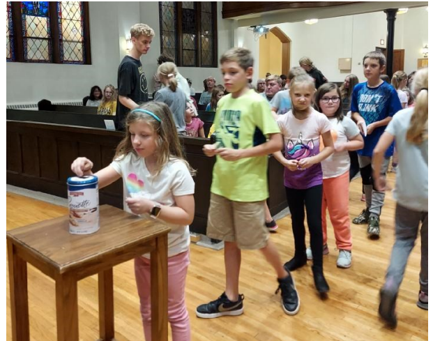
Children enjoy giving to the Noisy offering each Wednesday evening. We started with a small can and have gotten a bigger one. We now have one that we will grow into and the children love making a joyful noise for the Lord.