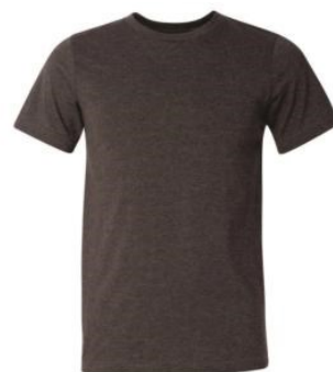
Bella Canvas Dark gray heather