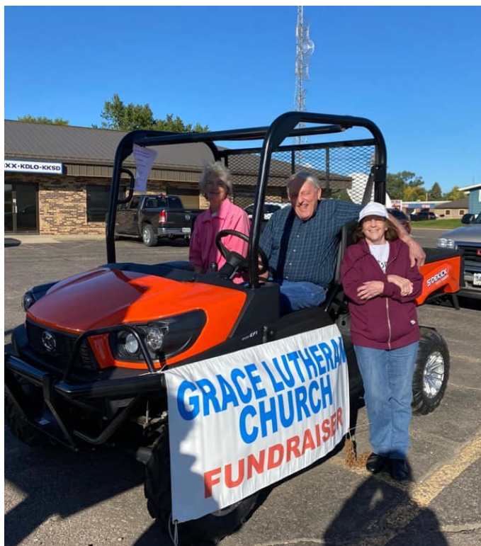
Several volunteers were available along Hwy 212 to sell tickets in the KWAT Parking Lot in September.