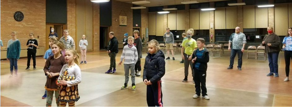
Above, Children and teachers enjoy the Wednesday school opening activities. They are filled with stories and fun ways to learn about GLOW (God Loves Our World) even while social distancing.

Due to the COVID pandemic the children's Christmas program has been cancelled this year. In place of it, the children will make cards and crafts to send to elderly in area assisted living, and care facilities similar to their project for God's Work, Our Hands Sunday. If you receive a special card or craft from one of the children, they would LOVE to have you take a picture with it and send it back to share with them. If you know someone homebound and would like to ensure they get one, please contact the office with their names and contact information. Thank you!