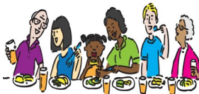
Community Christmas Supper

A BIG THANKYOU to Premier Bankcard Employees for always stepping up and donating most of the items for the supper!! Also, thank you to everyone who donated food or money; helped set up, cleanup, prepare, serve and deliver the meals.