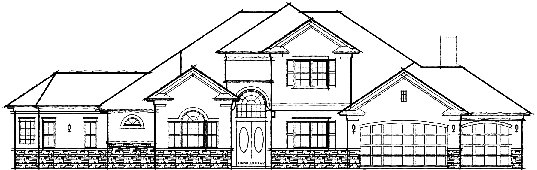
○ FRONT ELEVATION SCALE: 1/4"=1'-0"

© 2008, DAVID R. MANGO DESIGN GROUP, INC. ALL RIGHTS RESERVED