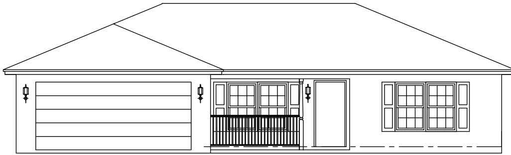
○ FRONT ELEVATION