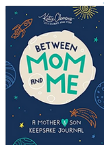
"Between Mom and Me" Journal