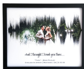
Heartbeat Art ( Artsy Voiceprint or SoundWaveArt.com )