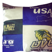
Keepsakes of T-Shirts