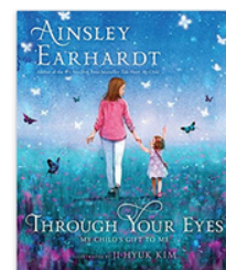
Voice Recorded Books (ex: A. Earhardt)