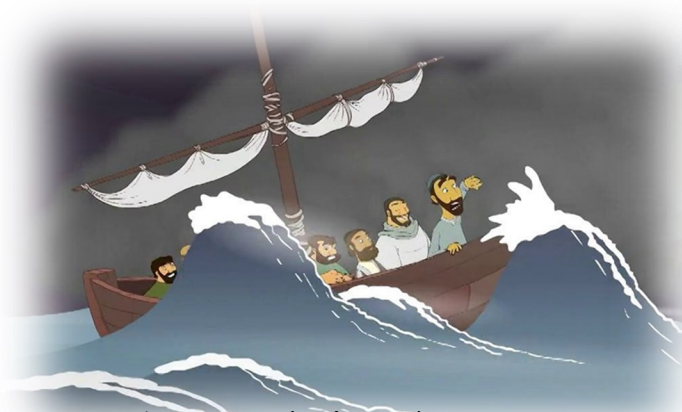
Jesus Calming the Sea

We have been having so much fun on Wednesday nights from 5:30 to 6:30 in the CLC. We had 25 in attendance the first night. We have talked about the Wonders that only God can do through the stories of Moses parting the Sea and Jonah and the Fish. All children going into K-5 th grades are welcome. The next 2 stories we will learn about are Jesus Feeds the 5,000 and Jesus Calming the Sea.