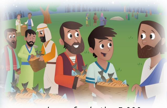
Jesus feeds the 5,000