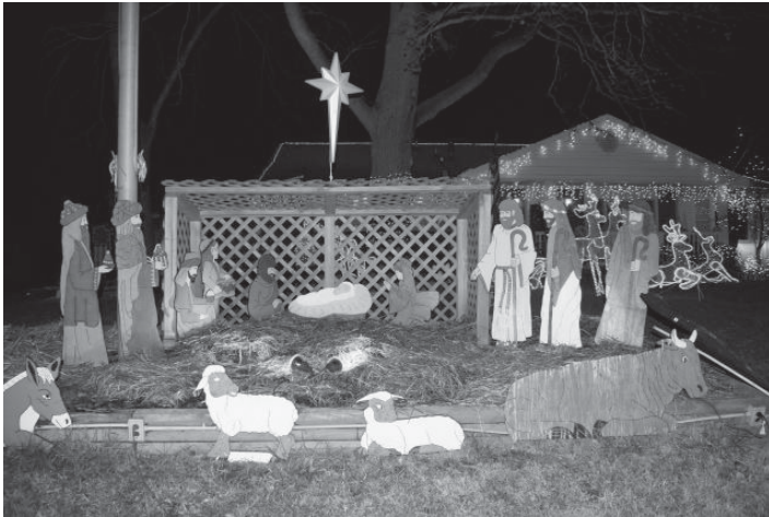
The award-winning display 'The True Meaning of Christmas' at Downey's, December 2007.