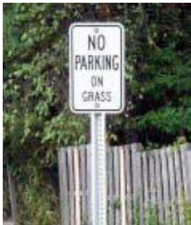
One of the new signs on Rose Hill Drive.

owners who keep the grass mowed and the trash picked up. The strip gives our 'main street' a boulevard appearance and enhances the value of our entire community. Violators who park on the strip could receive a ticket. Several have been issued and RHCA would rather you be forewarned of that possibility before it happens. The police aren't patrolling the strip, but they will issue a ticket if they see chronic offenders. RHCA supports the effort to keep our main street from looking like a parking lot.