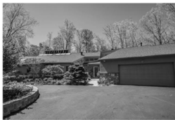
7330 Lackawanna Drive, Springfield Indoor pool, surrounded on all sides by nature!