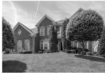
7100 Clarkson Drive, Springfield Almost 6000 square feet in this classic colonial!