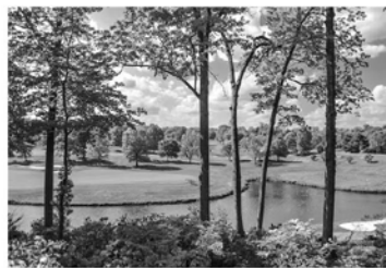
6700 Caneel Court, Springfield Wow - like living at the Masters Tournament!

Sure, we can help you get top market value for your current home, but we also have some wonderful homes listed that you may fall in love with. We can also show you any home listed by any realtor in all of Northern Virginia. Give us a call and we'll find your dream home together.