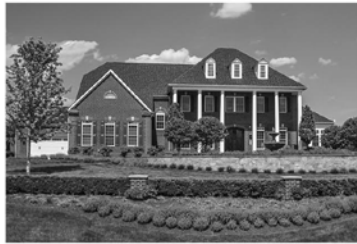
1635 Admirals Hill Court, Vienna Backyard oasis, 5 car garage, every luxury!