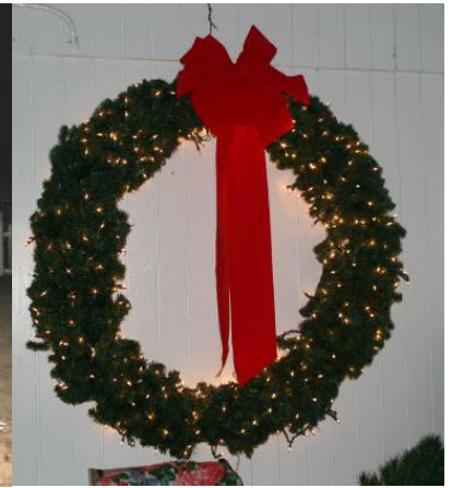
The Mayo's beautiful large wreath

President's Message Continued From Page 2