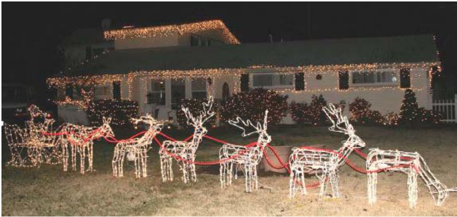
The Williams' display on Dew Grass Court