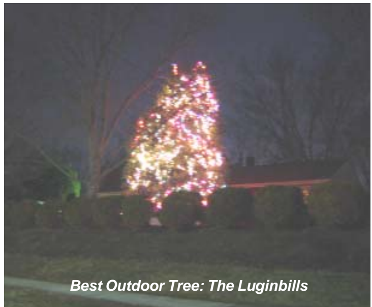
Best Outdoor Tree: The Luginbills

The Kaminskys, 6501 Haystack Road The Morrises, 6328 Rose Hill Drive The Vasquez, 6405 Rose Hill Drive The Caparases, 6707 Greendale Road The Wyckoffs, 6309 Saddle Tree Drive The Goods, 6404 Roundhill Road The Williams, 6121 Dew Grass Court The Webers, 6120 Dew Grass Court The Martins, 6115 Blue Grass Drive The Kalkorans, 6112 Clover Grass Drive The Shapiros, 6221 Driftwood Drive The Vereens, 6222 Thornwood Drive The Grigsbys, 6409 Willowood Lane The Cardones, 6418 Willowood Lane The Fosters, 6419 Willowood Lane